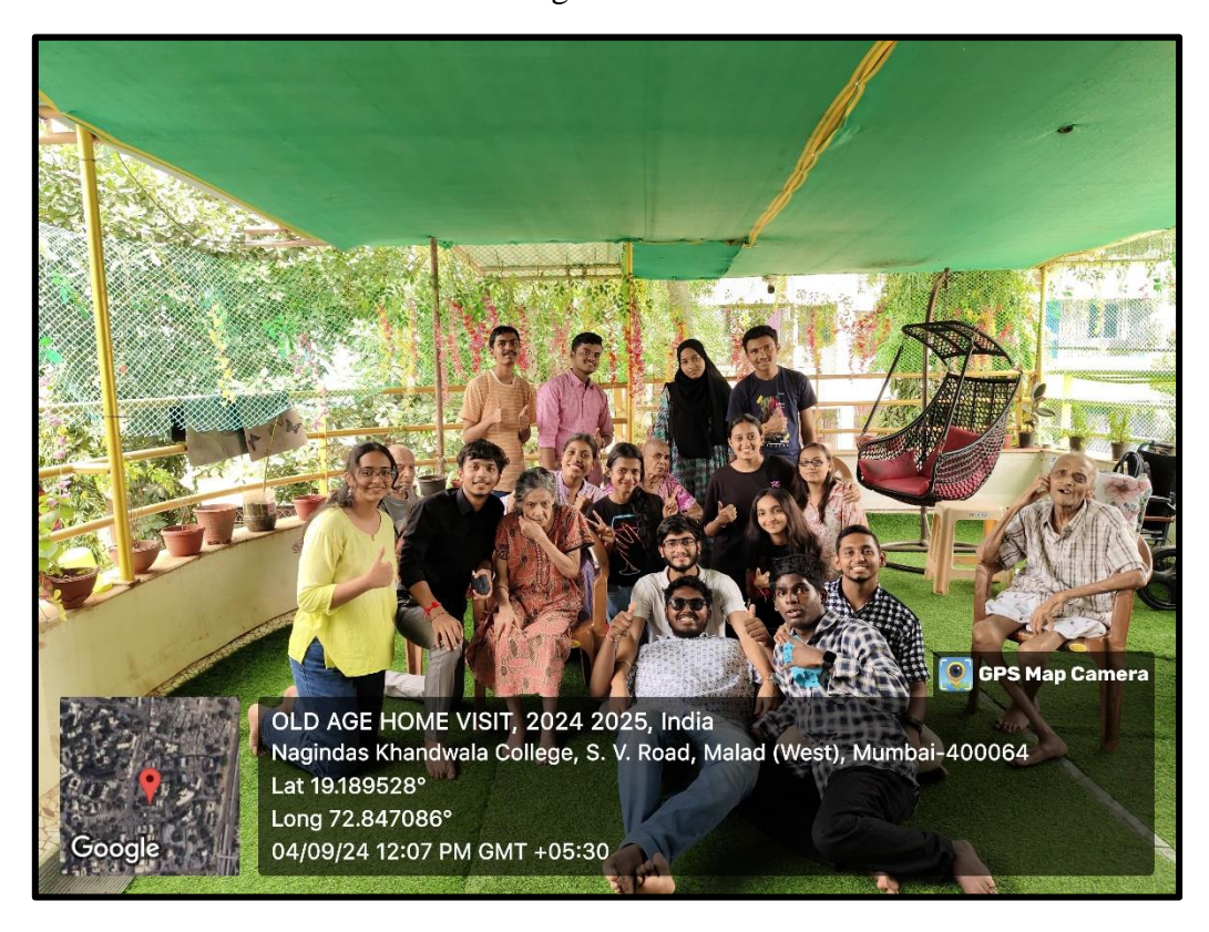
"Students of B-Foundation with senior citizens"