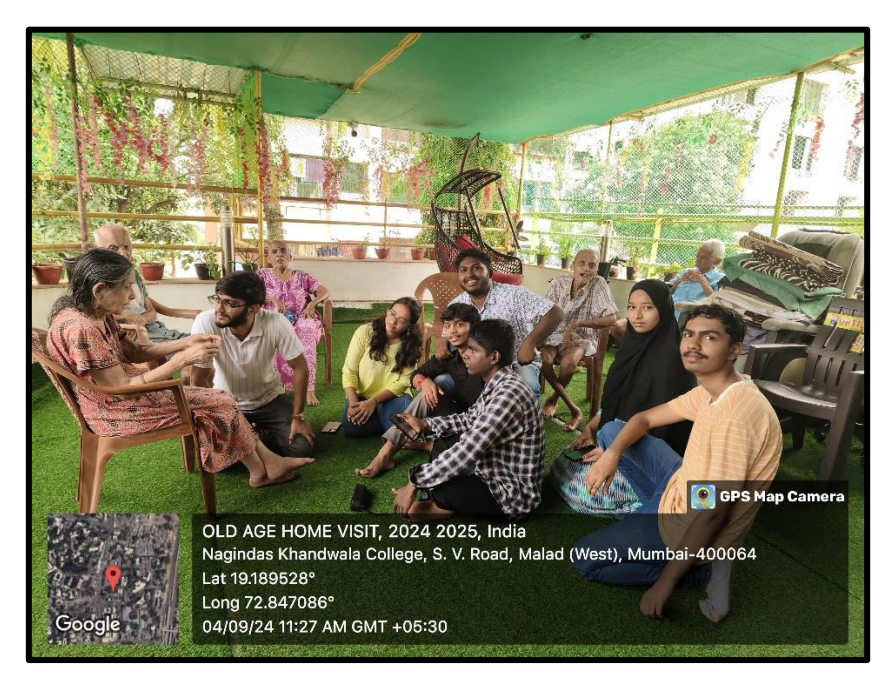
"Grandparents sharing their life experiences"