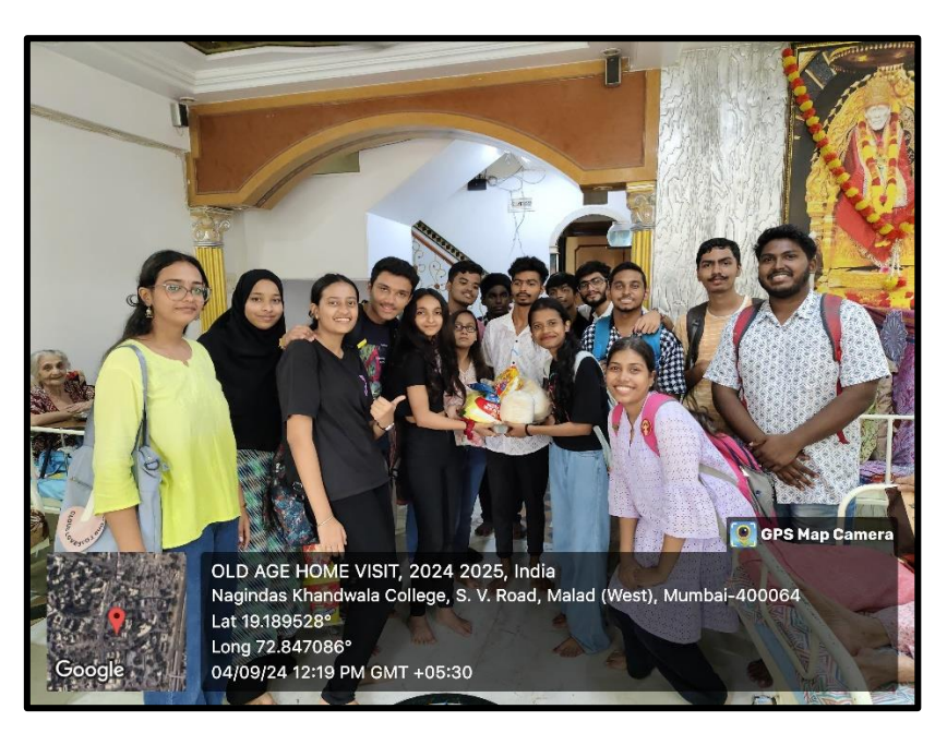
"Supplying the senior care faculty with food grains"