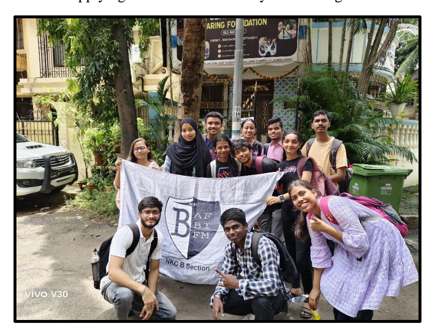
"Our B-Foundation Committee"