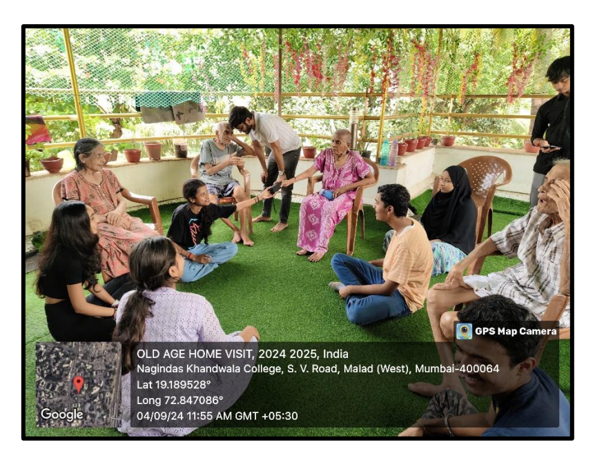
"Students of Banking and finance interacting with senior citizen"